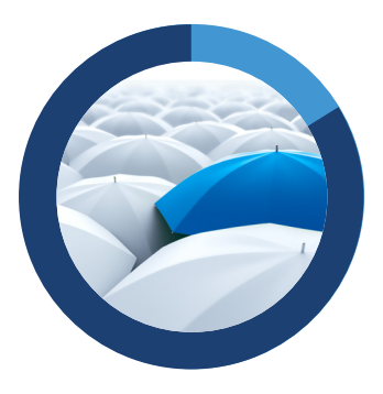
FIGURE 1 Lack of Liquidity Visibility

The most prominent area of impact is in decision making for treasurers and their executive teams. CFOs with limited visibility are slower to make decisions regarding money movement, internal funding of projects, or M&A activity. Furthermore, a lack of visibility can even impact the bottom line as companies may choose to be less aggressive in moving money into/out of the exchange markets and may opt for expensive external funding sources unnecessarily.